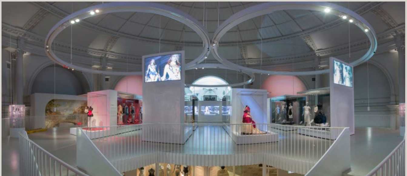
Image: Undressed at the V&A

A three-day course covering a wide range of practical aspects associated with developing a temporary exhibition, from concept to opening. Delivered by members of the V&A's Exhibitions department, a range of recent V&A exhibitions as case studies are used to explore the key elements involved with managing an exhibition, from planning and lender liaison, to design development and object installation.