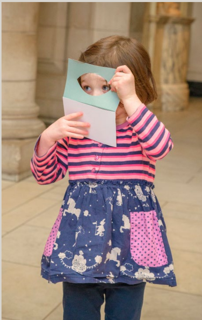
Image: V&A Family Activity - Family Art Fun