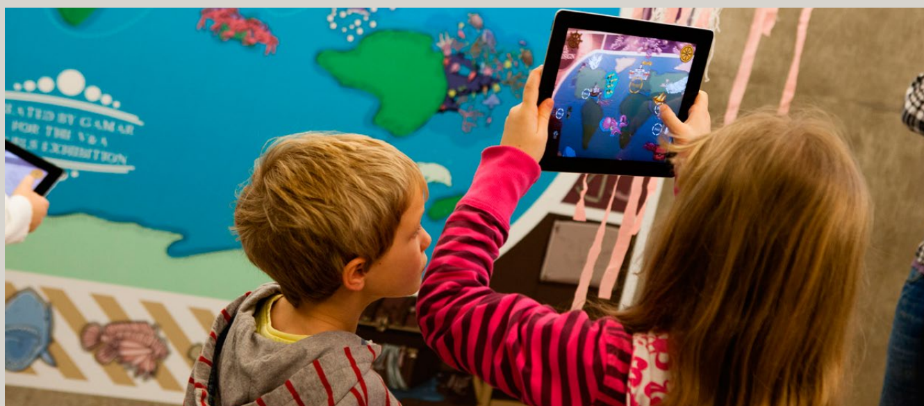
Image: Digital kids

A one-day workshop that will show how to initiate a digital learning programme that will bring your collections to life and work for all your visitors. It will consider how to choose equipment for different budgets, how to develop and maintain your programme, and examine first steps towards creating exciting sessions for your audiences. Led by pioneers in digital learning, the V&A's Digital Programmes team have been using technology in learning programmes with families, schools, adult learners and the creative industries since 2008.