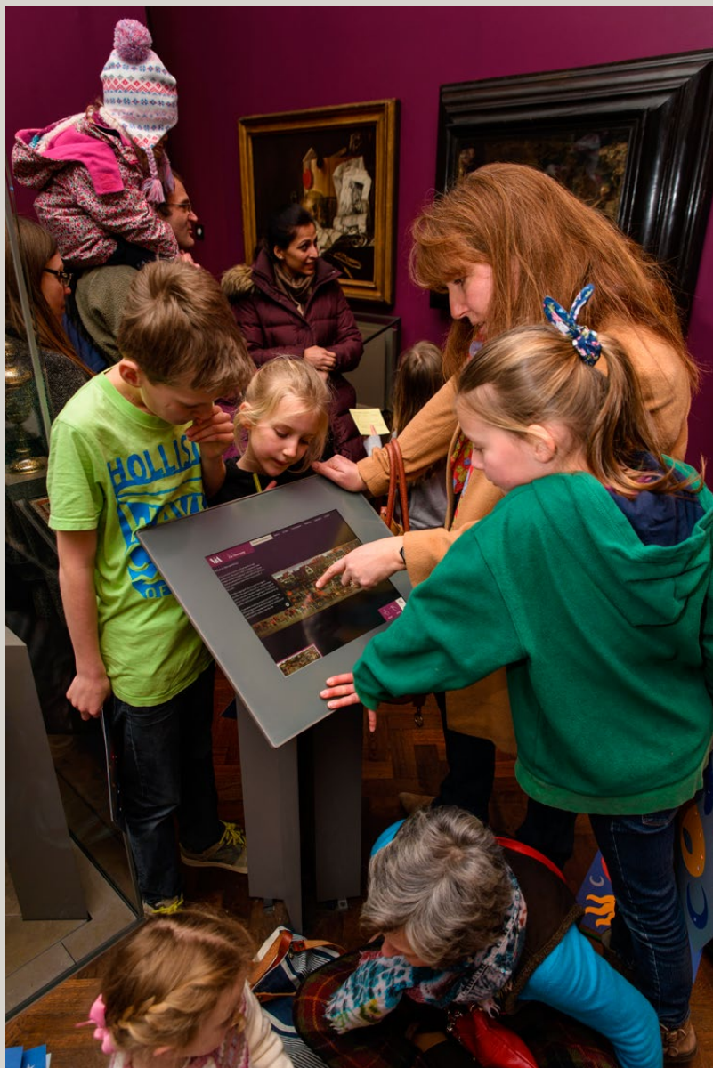
Image: Interactive Display, British Galleries